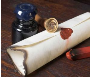
FOOD INVESTIGATION, VOLUME 4